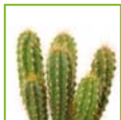
anger & stress